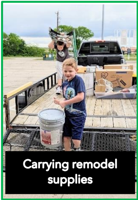
Carrying remodel supplies