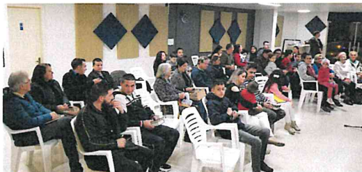
Father's Day service