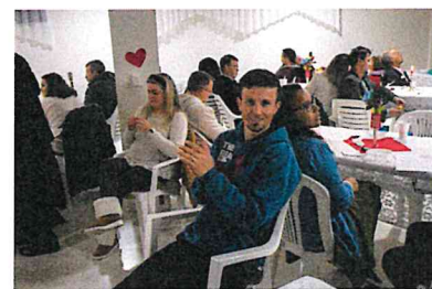
Couples Dinner activity

September stands out as a month of Gospel victory. Six souls made professions of faith in Jesus Christ as their Lord and Savior: one adolescent, two teens, and three adults! This coming summer (December-March here in the southern hemisphere) we'll be holding an outdoor baptismal service. We currently have over a dozen candidates.