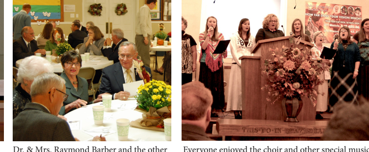
guests enjoyed the time of visiting and great meals served by the host church