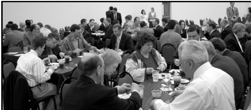
Left: Guests at the meeting enjoyed a delicious barbeque lunch, served by the students from Crown Southwest