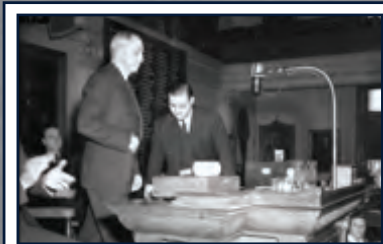
Norris addressing Texas Legislature – 1941.