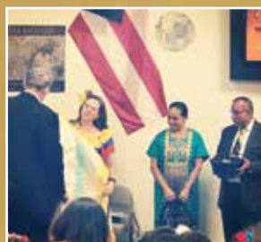
Missionaries receiving quilts

In November, we began planning and preparing for the next year's church activities. We will be making some changes in our kid's Sunday programs to free up more space in the church auditorium. The new Sunday program will be a big adjustment for our teachers and children. Please pray for our new Sunday program (that the transition will go smoothly), and most of all, please pray that God will provide a new church building for us. We are quickly running out of space, which is a GOOD problem to have! In the meantime, adjustments need to be made.