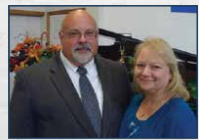
Moving Forward, The Griffins

With growth comes financial needs. The church building that we are renting needs many repairs, such as the bathrooms need new flooring, the room that we meet in needs repairs, and the ceiling fans need replacing, and our biggest prayer request is, we would like to move into the main auditorium but the two air conditioning units are broken, in addition, our vans need repairs. Please pray for these needs, thank you.