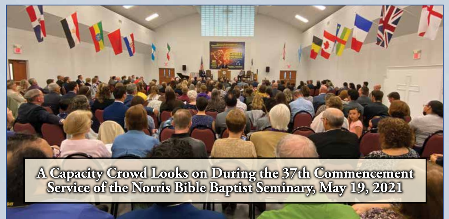
A Capacity Crowd Looks on During the 37th Commencement Service of the Norris Bible Baptist Seminary, May 19, 2021