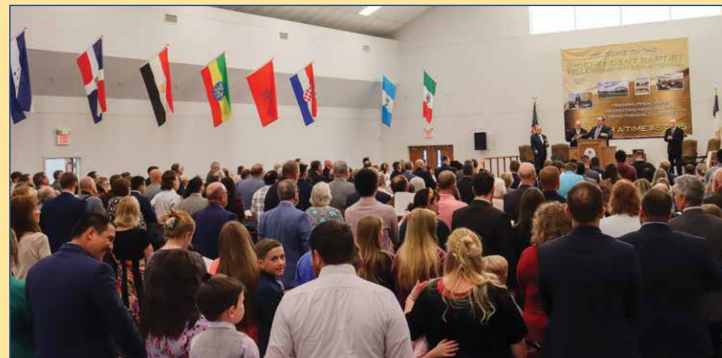
NBBS Opening Day Rally - Tuesday, August 9, 2022 - First Day of the New School Year!

FROM THE PEN OF THE PRESIDENT | NEWS & EVENTS | SCHOOL, MISSIONS & ALUMNI NEWS